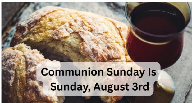
Communion Sunday Is Sunday, August 3rd